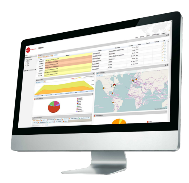
MarWatch Dashboard - Home View

"MarWatch allows us to proactively plan events based on factual data, which is less intrusive, mitigates risk and can be better executed with fewer people. All of which represents a significant step up in service for our clients and allows us to offer greater value for money." -4Sight Communications