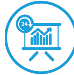
24/7 PERFORMANCE MONITORING