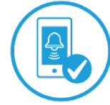
ALARMS & ALERTS