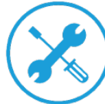
TESTING & SITE QUALIFICATION