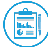
REPORTS & ANALYTICS